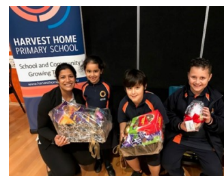
Our Easter Raffle Winners

Thankyou to everyone who purchased a raffle ticket for our Easter Raffle, we are so pleased to announce that $978 was raised! The teachers and students are discussing which books they want to purchase for their classroom libraries from the fundraising and will shortly make these purchases. Well done to the Parent Fundraising Committee for all their amazing work!